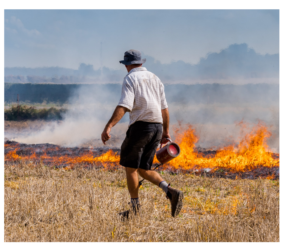
Crop stubble burn off, Canterbury, March 2018.

We also thank those who responded to the survey, and members of our Rural Fire Research Advisory Committee, especially Federated Farmers of New Zealand, who assisted in distributing the survey.