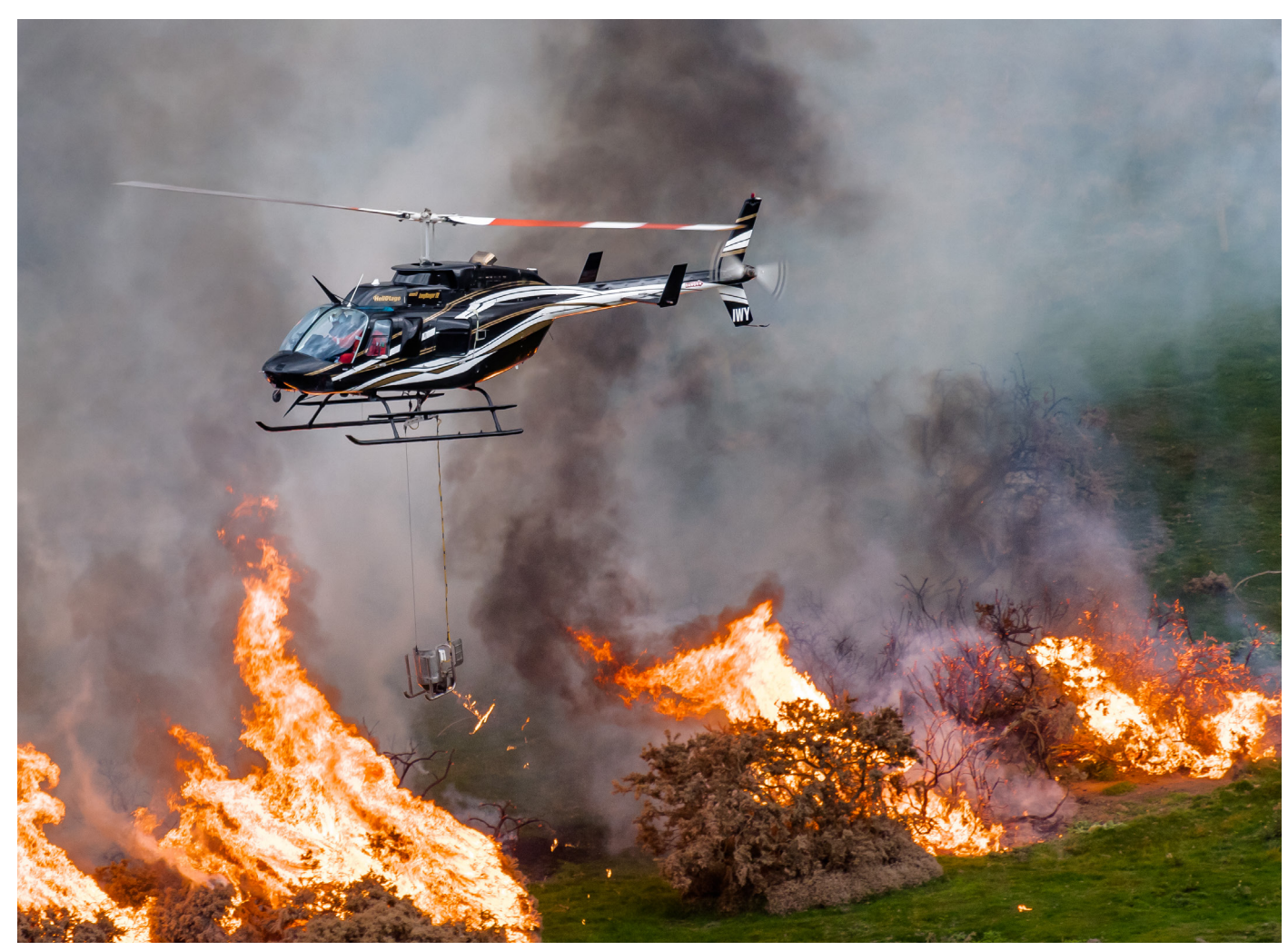
Land clearing burns to establish forestry in North Otago, April 2018.

The findings give a better understanding of the differences in fire use practices and concerns. The data can be used to help develop targeted messages that aim to reduce the adverse effects of fire, particularly effects on human safety and ecological damage, as well as help to inform the general public as to why burning is taking place.