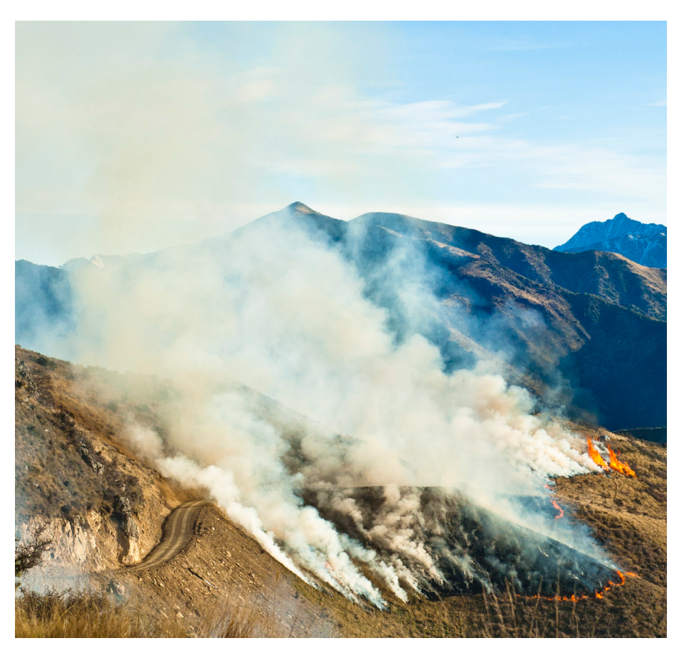
Burn off for forestry establishment, Marlborough, May 2015.

Some perceptions are held strongly, but by only a few people; while others are held by many people, but not so strongly (Fig 2).