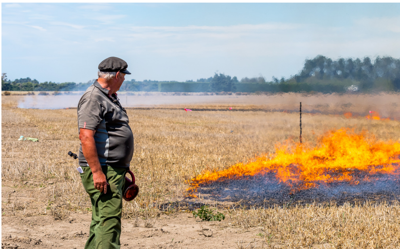
Figure 1: Farmers use fire to burn crop stubble ahead of replanting. No serious injuries have been reported for this farm practice.

While experienced high country burners use most elements of LACES, only around 10% of farmers we spoke with were aware of the term LACES. When prompted on LACES, many were conducting some of these elements, but very few enacted all five. Hardly any used a lookout or anchor points as a matter of course. To aid farmers in practically identifying safe zones and anchor points and why they are safe, as well as practical and operational aspects to look for and undertake when preparing a burn, international guidelines around safety at on-farm prescribed burns could be adapted to New Zealand conditions, along with standardised burn plan templates for various types of fires. In addition, making practical burn training opportunities available to farmers describing how to achieve land management goals, while maintaining safe burning practices under a variety of conditions, would help to mitigate injuries and fatalities.