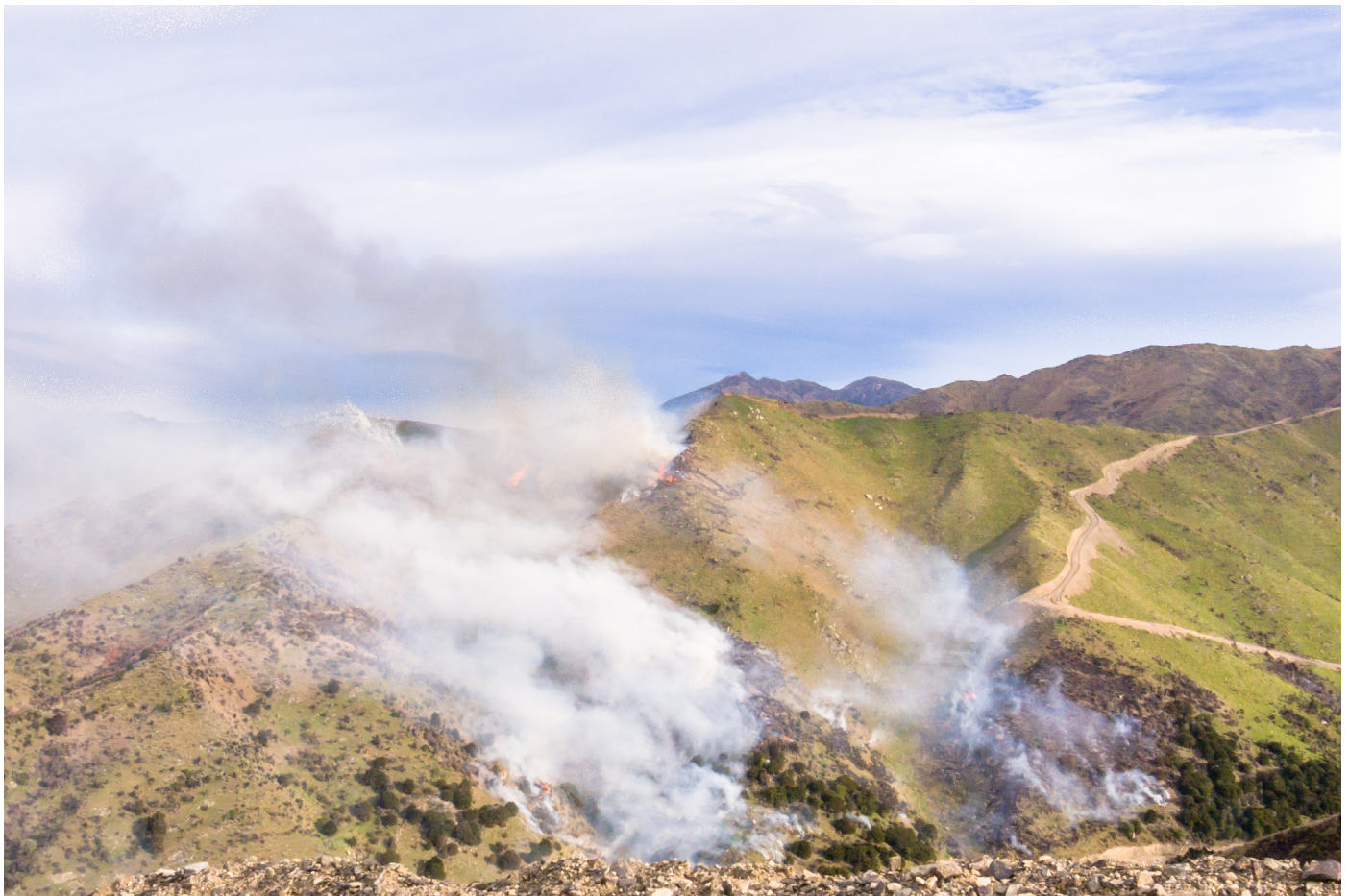
Forestry land preparation, Waihopai, 2014.

With this understanding, we can help farmers reduce the risk of injury to themselves and staff.