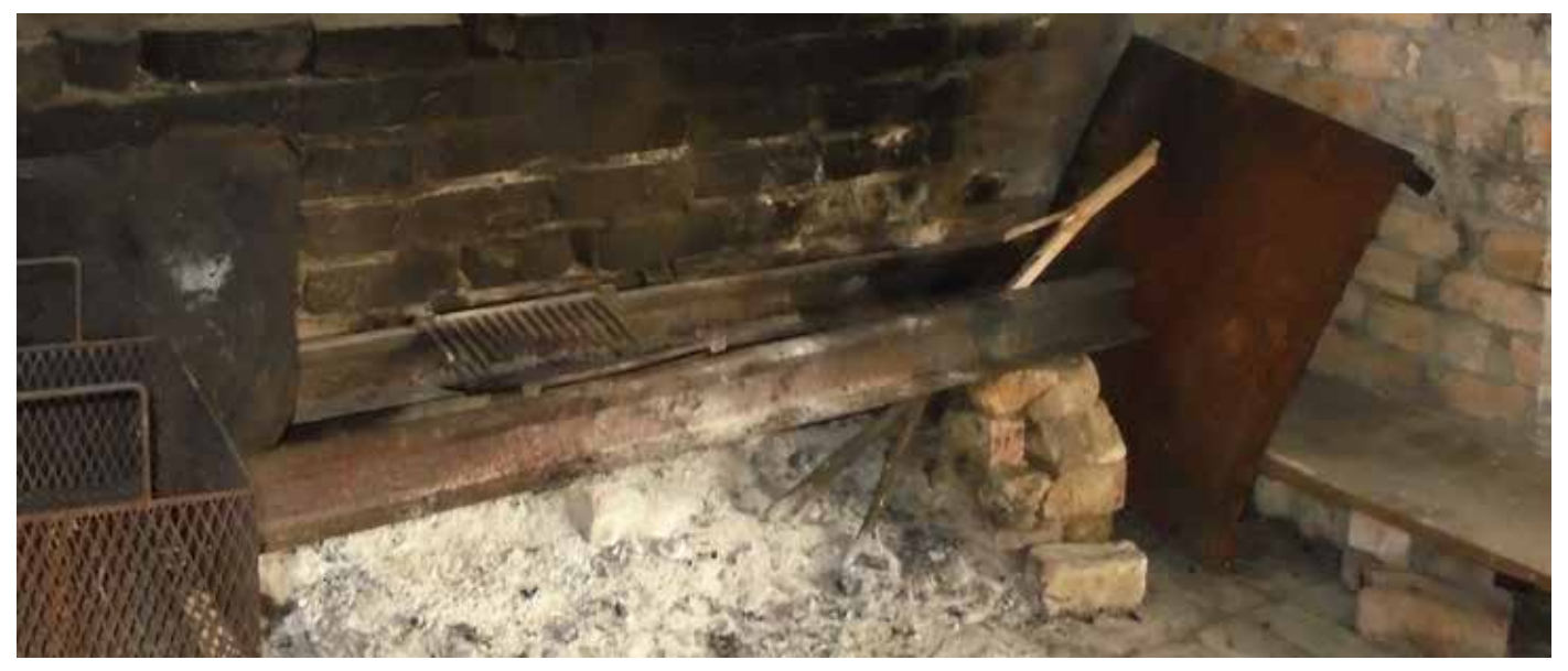
Figure 6: A kāuta on a Northland marae.