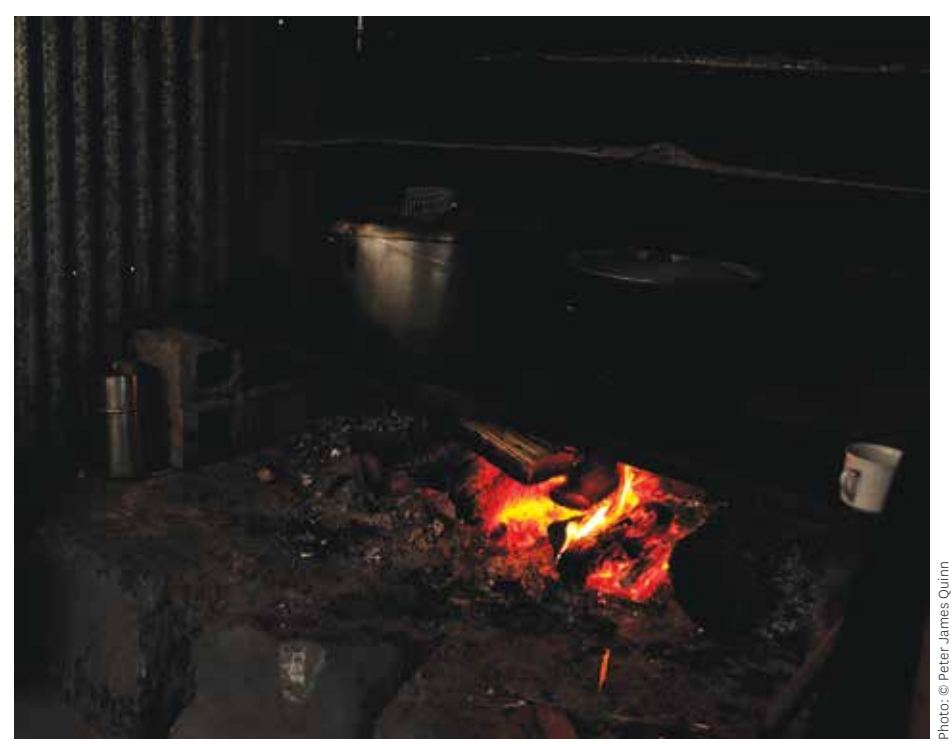
Figure 5: Ōpūtao marae, located at Ruatahuna, Ngāi Tūhoe.

Brookes, Barbara (2016). A History of New Zealand Women . (Wellington: Bridget Williams Books). 554 pp.