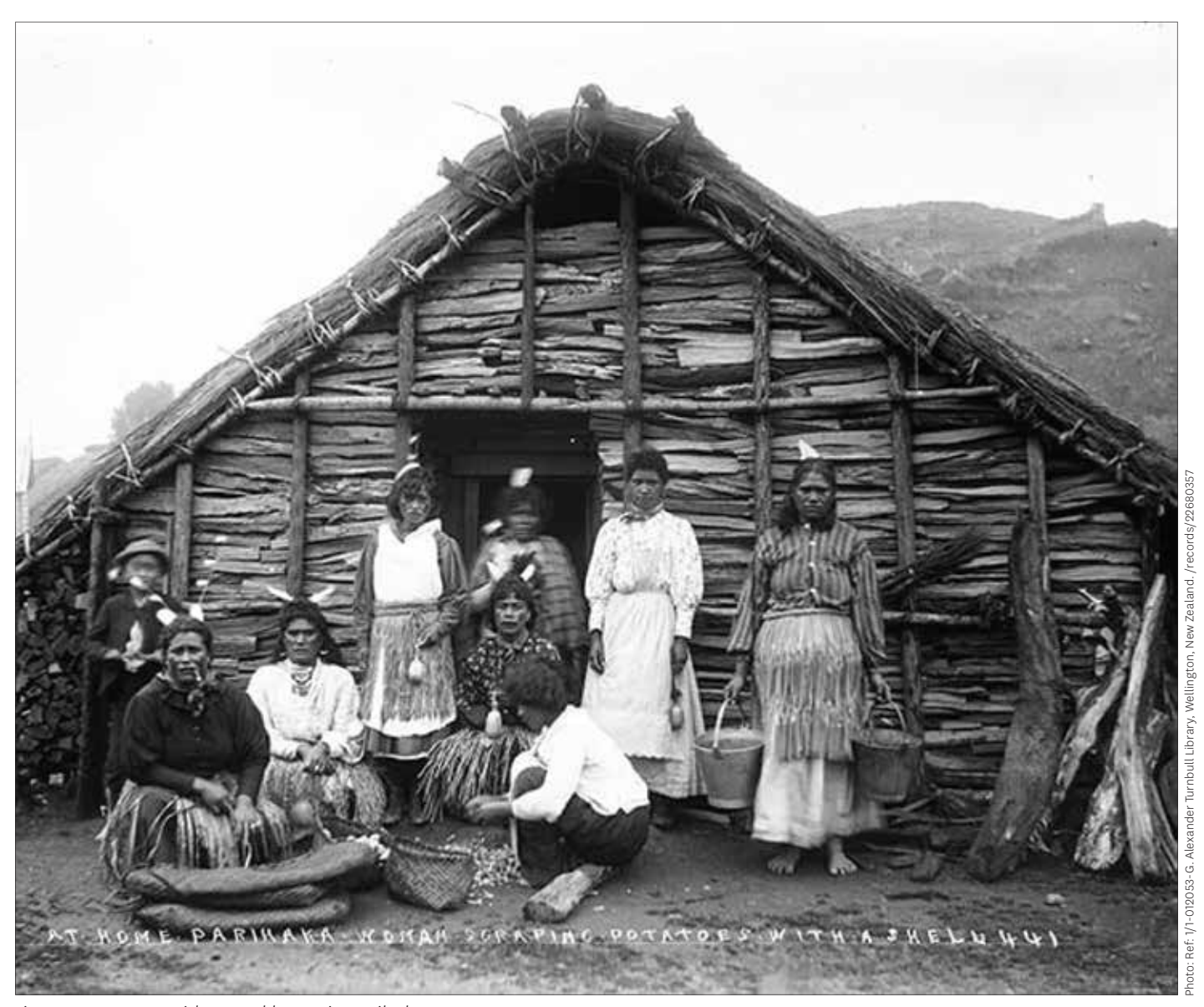
Figure 1: Group outside a cookhouse in Parihaka.

Traditional hearths: Bringing people together. The project brings scientists, tāngata Māori and regulatory agencies together to develop engineering design requirements for a contemporary kāuta.