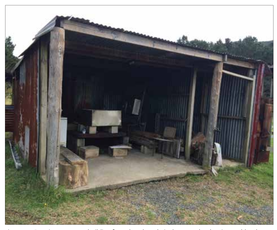
Figure 3: Kāuta in a separate building from the whare kai. Photograph taken in Northland, 2019.

This project will develop a set of design requirements to engineer a contemporary kāuta that meets cultural and regulatory expectations. The research team will use a systems engineering approach, which focusses on the design and management of complex engineering systems over their life cycle. One of the first steps in the systems engineering approach is to