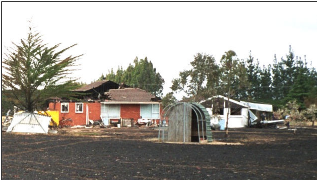
Figure 2. This house was destroyed in the 2003 West Melton fire.